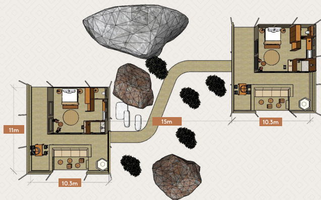
JACKAL 1 & 2 / Family Tent